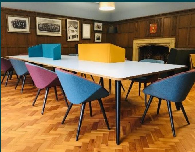
The MWP Lounge